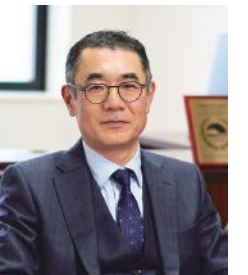
Dean of the Graduate School of International Management

* Aoyama Business School is also known as the Graduate School of International Management, Aoyama Gakuin University.